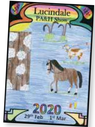
Runner-up cover design by Layla Clarke, year 4/5